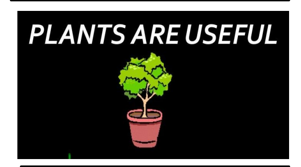
Observe and investigate